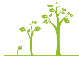
Personal and professional growth