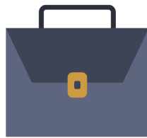
Connection with professional world