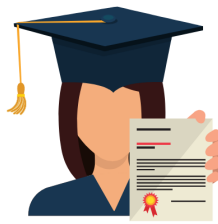
Culture of merit